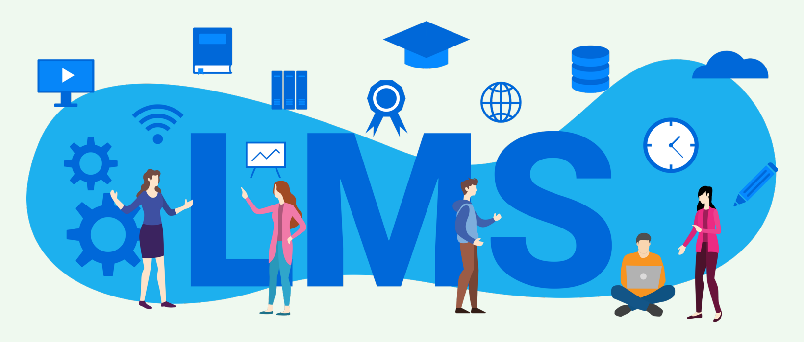
Learning Management System

It sounds complicated, but it doesn't have to be. At its core, all of these features and functions are about delivering content to new hires in an organized way and building connections authentically. Everything else is efficiency and data.